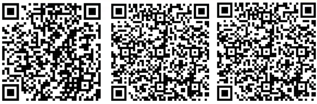
(Ficure 2. QrCodes for the themes Soft skills' Formation/Managing Conflicts)

Reflection position : Try to check whether you conducted the task correctly.