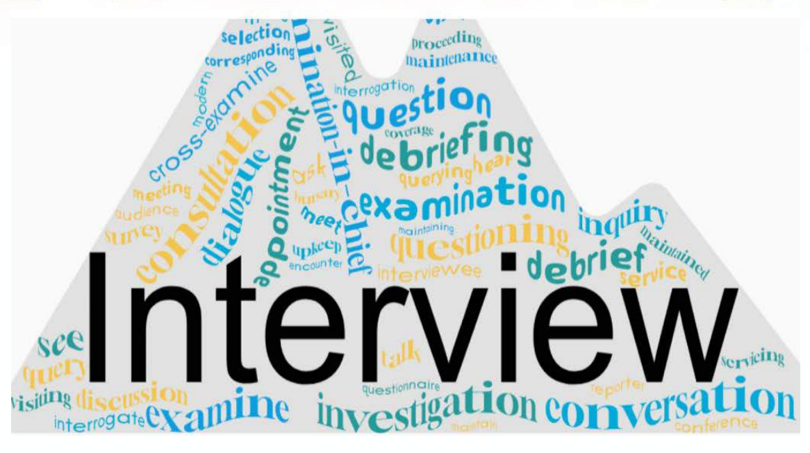
(Figure 1. WordCloud for the term Interview)

After the brainstorming we suggest students to watch the video which we had created earlier and to create their own hints in Renderforest.com for the successful applying for the job.