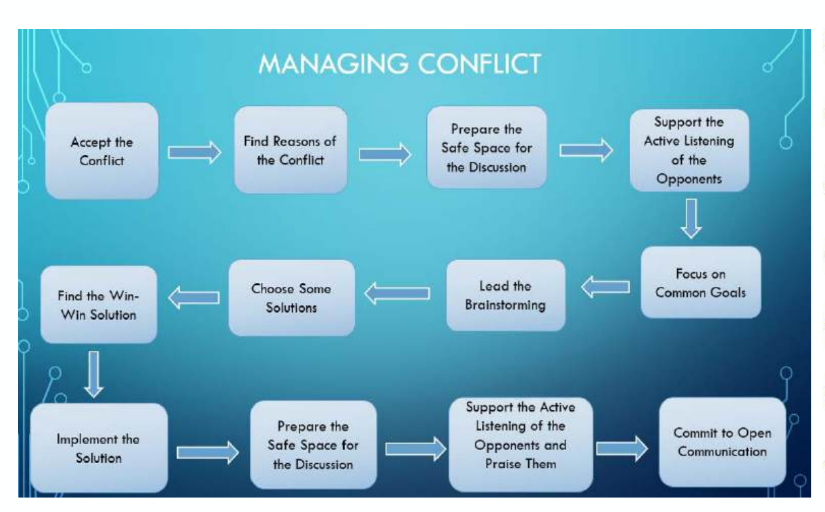
(Figure 3. The Sheme "Managing Conflict")

Reflection position : Try to check whether you conducted the task correctly Due to this we improve the students' critical thinking skills, including analysis, synthesis, comparison, conclusion, etc. This is the scheme which was given to our students during the Business English teaching.