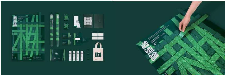
Fig.2. "WEAVE&MUTUAL" VI system design

VI design is also a type of visual communication design. VI is the visual identity system of the enterprise and an important part of the corporate image design. "Weave & Mutual" (Fig.2) integrates weaving into the VI design. The lines are intertwined, arranged front and back, and closely combined with each other. Four colors are juxtaposed and mixed to present colors with different appearances, showing the convergence of a team during cooperation. People with different expertise are bound to each other, closely overlapped, and revolve around each other to achieve ideal goals together. The bamboo weaving pattern is directly used in the design of the VI system. Through the overlapping of lines and changes in color, a clearly identifiable font is formed, and is used in the design of book covers. And when presenting, the woven lines are hollowed out, so that one of the lines can be extracted, which spatially highlights the essential characteristics of the weaving and improves the interactivity of the book cover. It is another application of the woven texture.