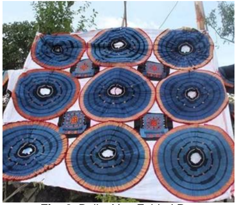
Fig. 2. Baiku Yao Folded Pants

Embroidery is commonly used to decorate the chest, back, cuffs, trouser legs, and waist of the clothes to beautify the overall appearance. At the same time, different branches of the Yao people have different preferences for materials and colors. The traditional dyeing method (fig.3) used for Yao brocade creates a concave-convex texture on the surface, with mostly red, white, and yellow colors. Among the Baiqu Yao people in Nandan, Guangxi, they are skilled in embroidery and breed a local species of silkworm called "golden silkworm". They use a unique method to collect silk, which involves placing the silkworms that are spinning silk on a smooth wooden board and allowing them to spin freely. When the silk layers accumulate to form a cloth, they can obtain a whole piece of silk fabric.