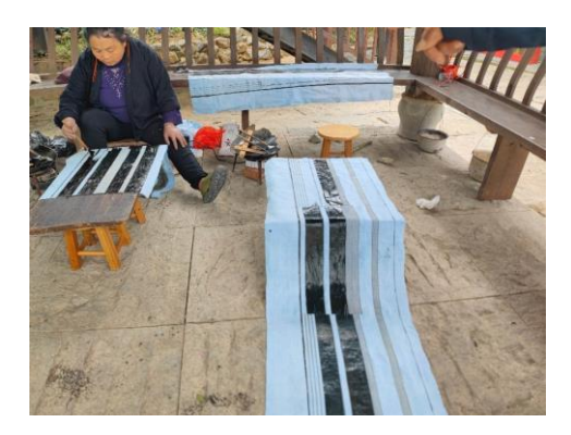
Fig. 3. Traditional Resin Dyeing in Baiku Yao Ethnic Group

In addition, the traditional handmade production method of Yao clothing involves many complex steps, including preparing materials, weaving cloth, dyeing, embroidery, cutting, and embellishing. These steps may require dozens of procedures, especially for ceremonial clothing used in weddings, which may take several years to complete.