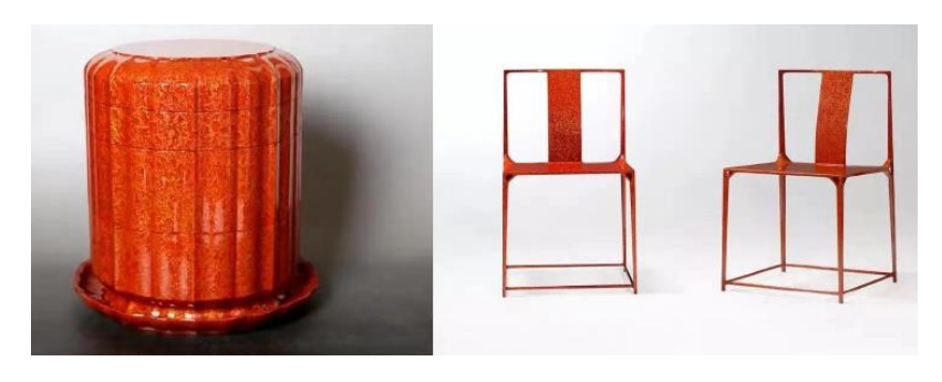
Fig. 1.Red and gold spotted rhinoceros paint

Since modern times, with the continuous progress of craft technology and social changes, lacquer patterns still play an important role in the inheritance of traditional Chinese culture. Chinese modern lacquer is derived from the lacquer craft that has been inherited for thousands of years. After integrating the aesthetic concept and modeling language of contemporary painting, it has achieved a breakthrough in concept and transformed into a pure art form.(Deng,2023) At the same time, the injection of modern technology and design has also brought new opportunities and challenges to the innovation of lacquer patterns. By combining traditional lacquer patterns with modern aesthetic concepts, some artists and designers have created many works with both traditional charm and fashion flavor (Fig. 1), injecting new vitality into the inheritance and development of lacquer patterns.