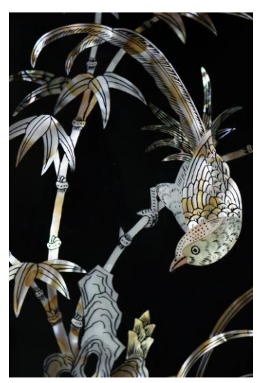
Fig. 2. The magpie gives good news