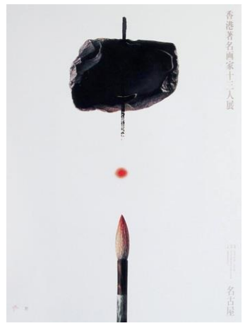
Fig.1. Thirteen Hong Kong Famous Ink Painters Exhibition in Nagoya (1989) [4]

dots seem to be flowing, which at the same time gives the poster some beauty of meaning.