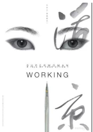
Fig.2. Big Woman. A Tale of Four Cities: Living Beijing (2003) [5]

In the poster of "Big Woman - A Tale of Four Cities" designed by KAN Tai-keung, the concept of "Two Cities" is used as the creation of four virtual cities, "Live Kyung", "Boiling Kyung", "Ki Kyung" and "Ki Ling", to show the different lives of modern women. "Himekyo" and "Himeleung" to show the different lives of modern women.