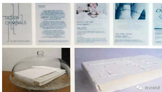
Fig. 5. Book design of "Tofu-Recipes"