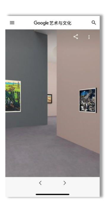
Fig.1. Pocket Gallery is an online exhibition project in collaboration with Google Art & Culture and the Central American Museum of Art [11].