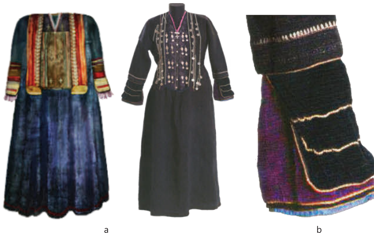
Fig. 2. a – type of juba; b – juba's cuffs

wrist, a kind of replaceable element – the so-called «sakhelkuro». It is obtained by connecting different colored (mostly black, blue or dark burgundy) velvet or woolen cloth, several cuff-like details, and can be decorated with colorful appliqués, embroidered broken ornaments, gold and silk twine threads, pleated borders, laces,