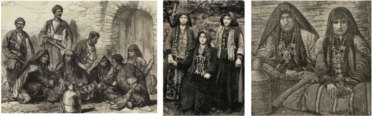
Fig. 1. Tushetian clothing: a – from an old photograph; b – from British magazine «The Illustrated London News» 22/10/1873; c – from French-language magazine «Le Coucasse Illustre» 1899-90 № 3

The inhabitants of Tusheti, especially women, have been skilled in processing sheep's wool, felting it and knitting wool since ancient times. Several types of wool (the so-called «toli») were produced by domestic industrial method to make clothing. Even after the mass introduction of factory-made products, this tradition was preserved until the 1940s, and the most of the population continued to use products produced in family conditions.