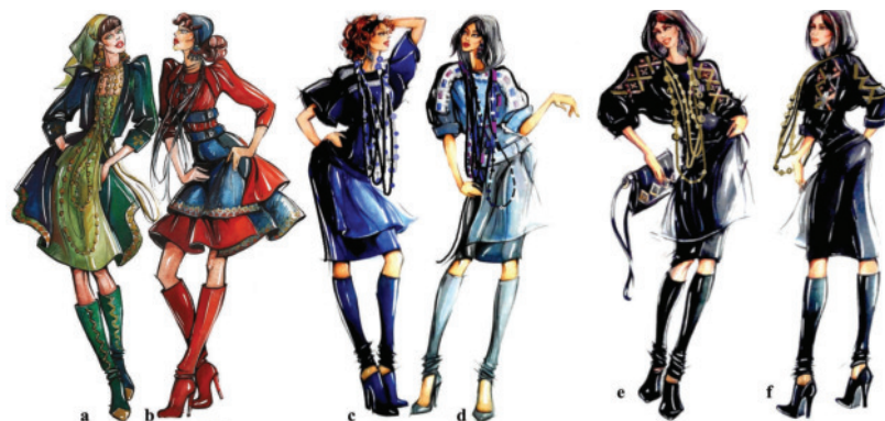
Fig. 5. Modern youth sets with elements of a Tushetian ethno-costume (Author L. Kiknavelidze, 2022)

The youth set – model 3 (Fig. 5, c), is a composition inspired by the decoration of Tushetian clothing, belt and apron; Here, the horizontal stripes of the skirt are the inspiration for the jubilee's vertically arranged saulis of the juba. The model is accented with the traditional blue color and the rectangular shape, typical of juba. The youth set – model 4 (Fig. 5, d) is also an interesting composition obtained by combining