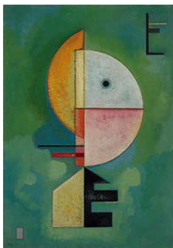
Figure 1: Wassily Kandinsky, Upward , 1929.

The idea of using applique for the men's clothes decoration is embodied in the Master`s thesis of Valentyna Shahman. A collection of men's cardigans has been developed, which are decorated with a stylized applique based on the painting "Upward" by W. Kandinsky (Fig. 1). The use of geometric shapes in the knitwear decoration is always a win-win situation. The pattern of geometric shapes can both emphasize a particular part of the body and hide flaws. Therefore, geometry has been and will always be the most favorite ornament for clothes decoration.