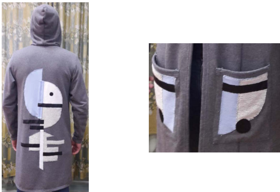
Figure 3: Appliques on products

One of the most important tasks in the creation of this collection was the selection of knitted fabrics. Firstly, the main fabric must be stable, maintain its form and shape during using and not impede the movements of a potential consumer. Secondly, the fabric must have good heat properties. At the same time, the main fabric shouldn't have reliefs at the surface, since this will interfere with the applique application. Thirdly, the fabric should not unravel easily. That is why invisible fleecy fabric with an elastomeric thread content (Table 1) was chosen as the main for the collection's production. This is a single knitted fabric with a smooth surface on the front side. An elastomeric thread improves relaxation characteristics, namely, reducing residual deformation. In addition, the elastomeric thread increases the density of the knitted fabric, which improves the heat properties and reduces the unraveling. This fabric has got different textures and colors at the front and back fabric's sides. This allows creating an additional decorative and color effect for example at the cardigan's hood. In addition, decorative effects on the front parts of models 4 and 5 are also made through the use of the backside of knitted fabric.